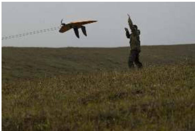
Figure 3.7.2: Supercam S250 drone, launching from the catapult

We made 5 flights in total. Two for Samoylov Island and three for Kurungnakh Island. Atmospheric conditions were different on four out of five flights. First flight on Samoylov: cloudy, no rain, soft light, slightly dim. First flight on Kurungnakh: sunny at first, slightly cloudy towards the end of the flight. Second and third flights on Kurungnakh: sunny days, but hazy due to forest fires in Yakutia (haziness mostly mitigated in postprocessing afterwards). Second flight on Samoylov: sunny day, no clouds, no fog, very good visibility, high contrast - deep shadows on the ground, clearly visible flares on the water and other reflective surfaces (see Figure 3.7.3 for details).