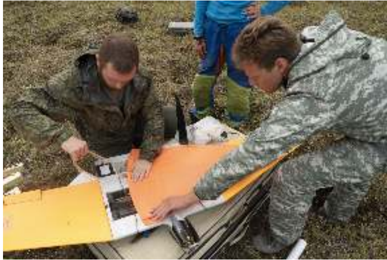
Figure 3.7.1: Supercam S250 drone, preparation for launch

We made 5 flights in total. Two for Samoylov Island and three for Kurungnakh Island. Atmospheric conditions were different on four out of five flights. First flight on Samoylov: cloudy, no rain, soft light, slightly dim. First flight on Kurungnakh: sunny at first, slightly cloudy towards the end of the flight. Second and third flights on Kurungnakh: sunny days, but hazy due to forest fires in Yakutia (haziness mostly mitigated in postprocessing afterwards). Second flight on Samoylov: sunny day, no clouds, no fog, very good visibility, high contrast - deep shadows on the ground, clearly visible flares on the water and other reflective surfaces (see Figure 3.7.3 for details).